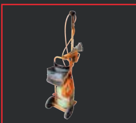
936 GAS BOTTLE TROLLEY