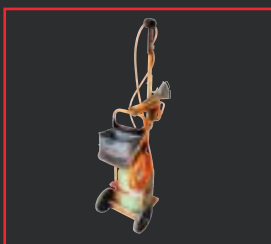
936 GAS BOTTLE TROLLEY