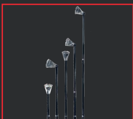
RIPACK GUN EXTENSION POLES